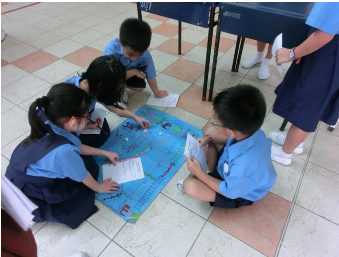
Green Captains conducting activities for their friends at the booths.