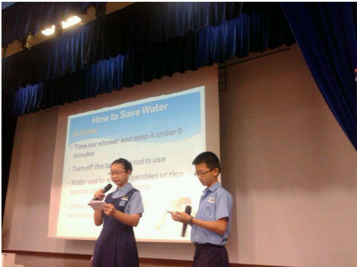
Head and Vice Head of Green Captains conducting a Pre-Assembly talk on Saving Water

Chongzheng celebrated World Water Day from 10 to 14 March 2014. A pre-assembly talk was conducted by the Head and Vice Head of Green Captains on the importance of saving water. An On-the-Spot Drawing Competition was held among the Primary 3 and 4 pupils to draw posters on Saving Water. An exhibition was also held during recess time with booths set up by the Green Captains to educate the peers on the 4 National Taps of Singapore, the sources of water pollution and the ways to save water. The information was totally planned and prepared by the Green Captain EXCO members.